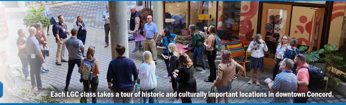
Each LGC class takes a tour of historic and culturally important locations in downtown Concord.