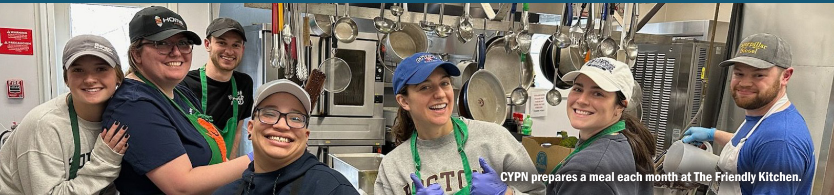
CYPN prepares a meal each month at The Friendly Kitchen.

Scan the QR code or visit my.concordnhchamber.com/event-calendar to sign up for these events.