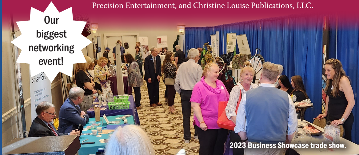
2023 Business Showcase trade show.