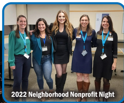
2022 Neighborhood Nonprofit Night

CYPN invites local young professionals and college students to its annual Neighborhood Nonprofit Night! Get inspired, network with friends, enjoy refreshments, and enter to win one of our many awesome door prizes. This networking event will connect you directly with local nonprofits who are doing amazing work in our community. Find a cause you are passionate about, and learn how you can get involved as a volunteer or board member. We've invited New Hampshire nonprofits who are specifically looking for young professionals who are passionate about making a difference in the community. Special thanks to our presenting sponsor, Merrimack County Savings Bank. Additional support is provided by Concord Hospital Trust and the Capitol Center for the Arts. Learn more, view our list of participating nonprofits, and register at my.concordnhchamber.com/event-calendar .