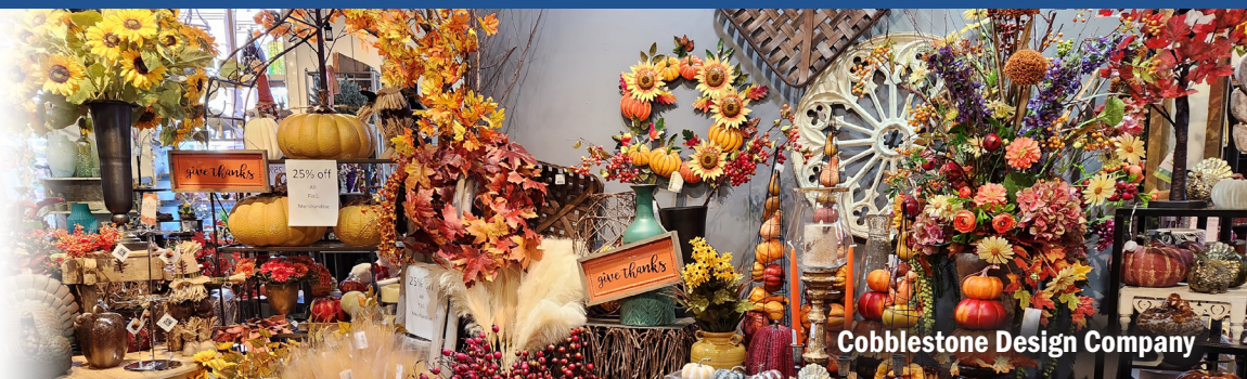
Cobblestone Design Company