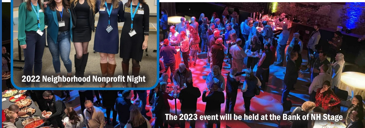
The 2023 event will be held at the Bank of NH Stage