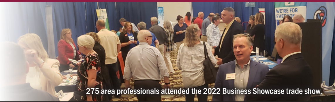
275 area professionals attended the 2022 Business Showcase trade show.

Last year, The Hotel Concord was recognized as Small Business of the Year for its stellar service and community impact. Bangor Savings Bank was celebrated as Business of the Year for its impressive volunteer efforts and generosity to local nonprofits. (Continued on page 4)