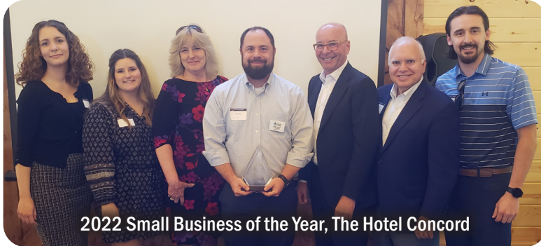
2022 Small Business of the Year, The Hotel Concord

Pinnacle Award recipients have received their awards with moving expressions of gratitude, standing ovations from the audience, and tears of joy. We hope you'll get involved in this process and help us select the 2023 Pinnacle Award recipients by April 14. Our online form is quick and easy to fill out and can be found at concordnhchamber.com/pinnacle-awards .