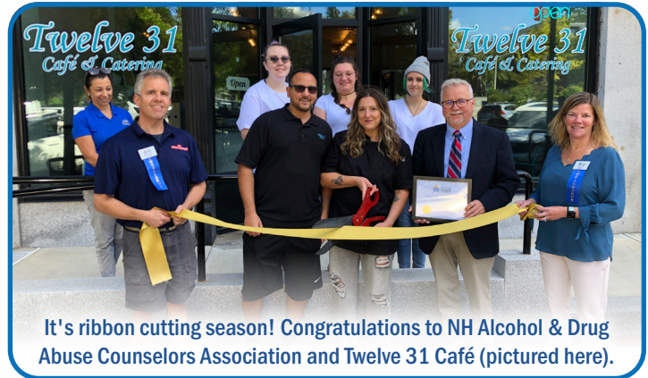
It's ribbon cutting season! Congratulations to NH Alcohol & Drug Abuse Counselors Association and Twelve 31 Café (pictured here).